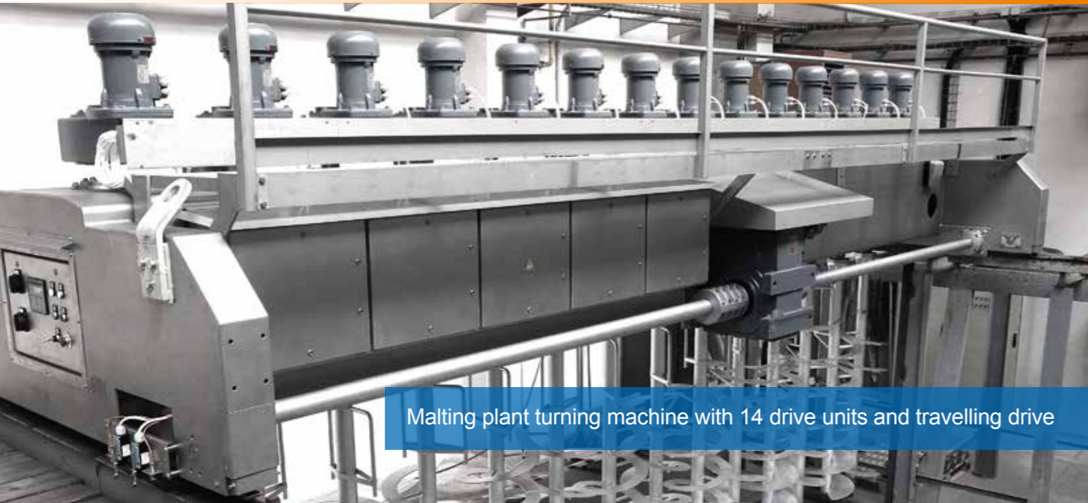
Malting plant turning machine with 14 drive units and travelling drive