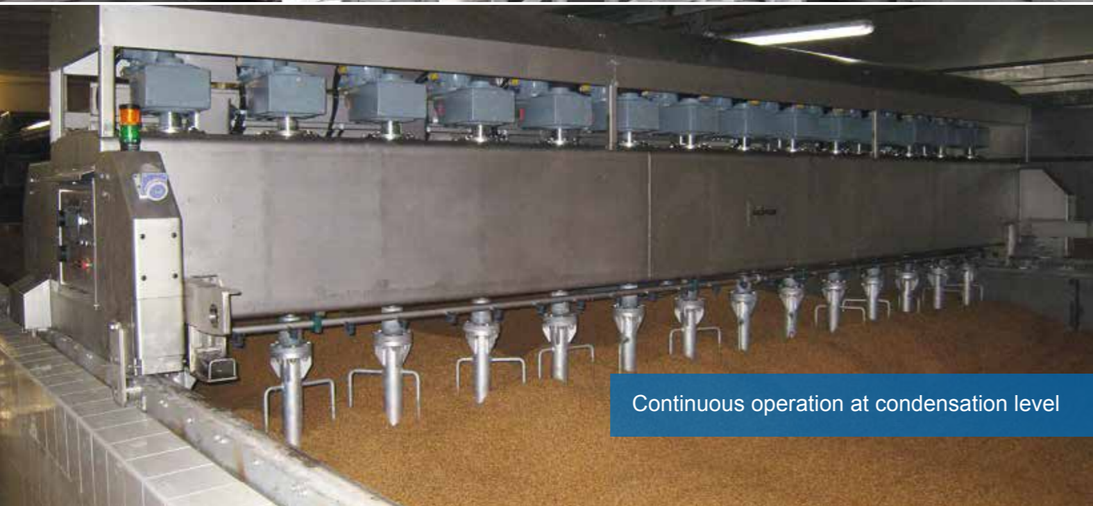
Continuous operation at condensation level