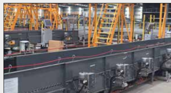
BCS solution for Toll IPEC facility Melbourne

Our business breaks into three business units being Airport Systems, Operations and Maintenance and our newest business unit Services and Solutions (SaS).