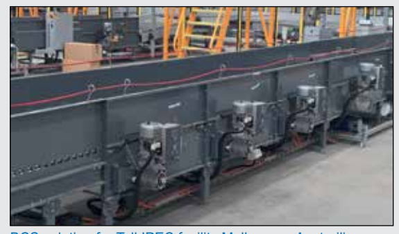
BCS solution for Toll IPEC facility Melbourne, Austrailia

industrial customers around the world. Our business breaks into three business units being Airport Systems, Operations and Maintenance and our newest business unit, Services and Solutions (SaS)